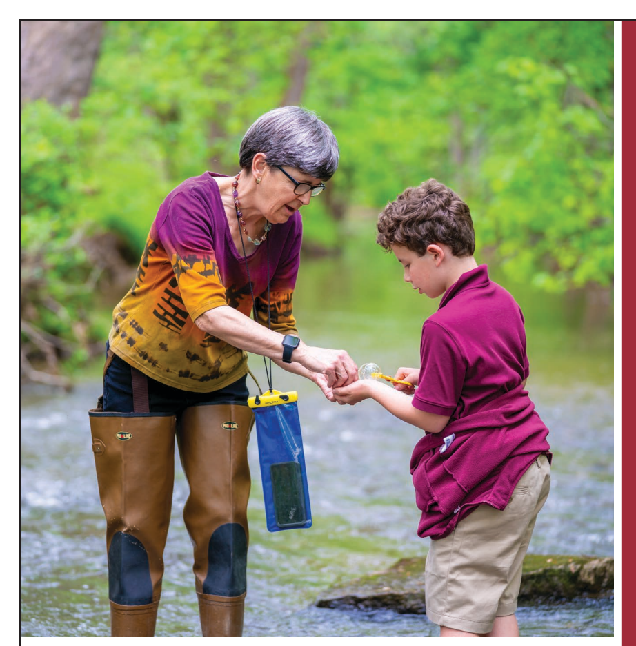
Students in all grades are also supported in developing healthy habits and pursuing qualities of integrity, respect, responsibility, and a passion for service to others.